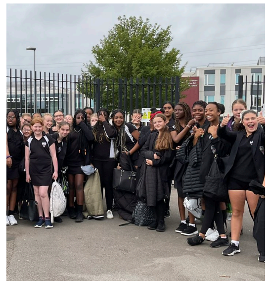
Image: pupils returning from the netball tournaments at Moorside High School this week

Pupils are able to complete a wish list from the school library and parents can pay easily via the online system. What's more every book purchased means free books for our school.